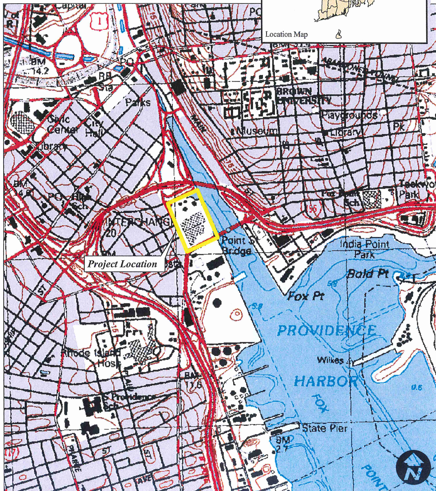
Figure I-1 Vicinity Map