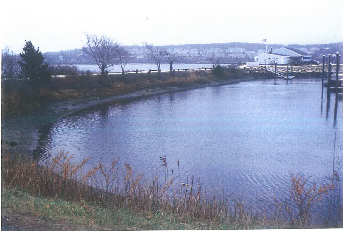
Existing bank and proposed seawall area looking northeast.