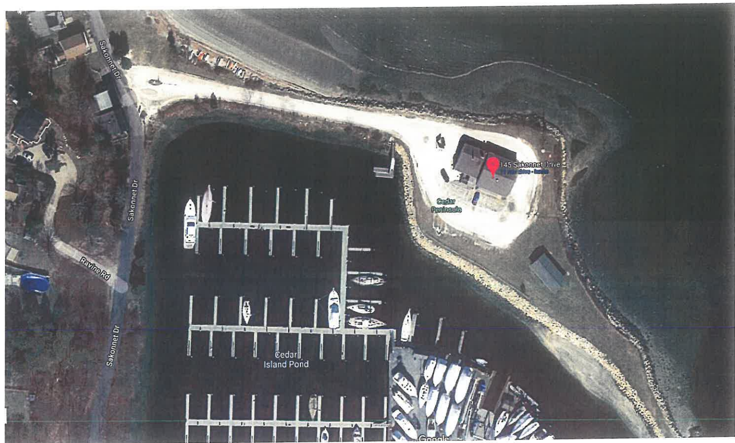
Aerial view of existing site and seawalls