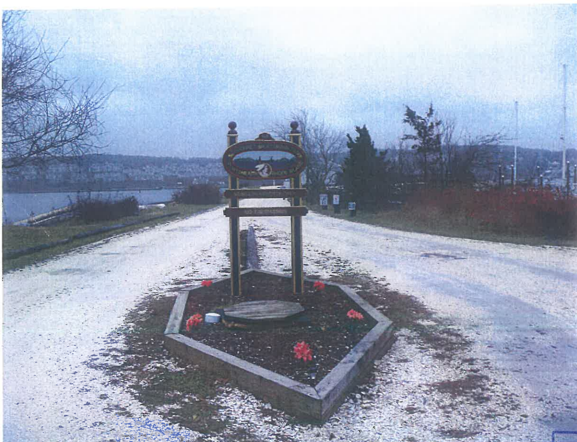
Looking east from road down driveway to site.