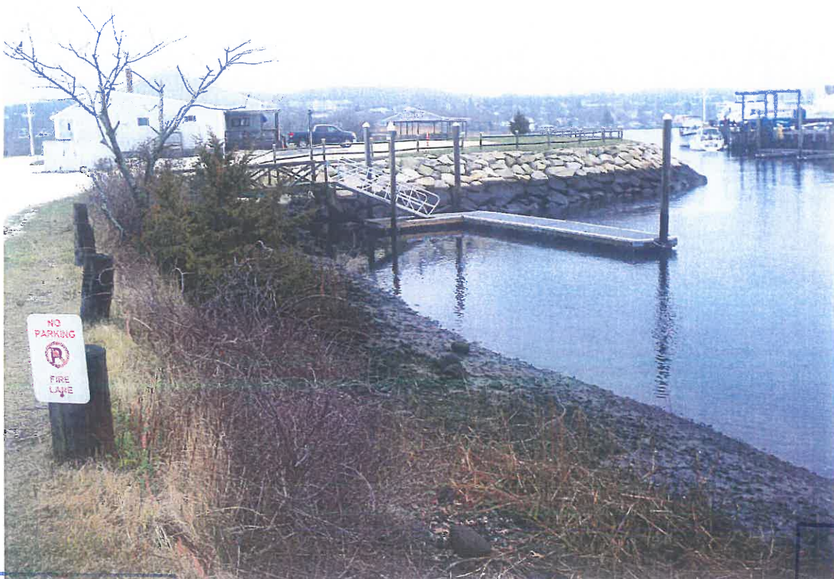
Existing bank and dock, recent seawall improvements in background. Existing marina to south.