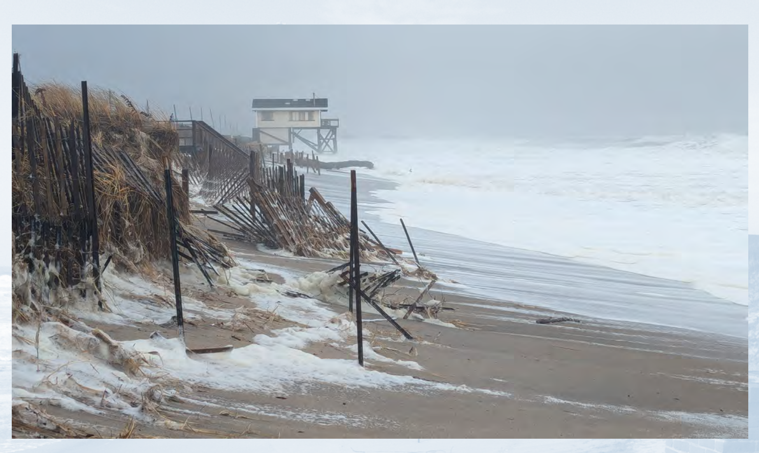
Charlestown Beach Road, South Kingstown