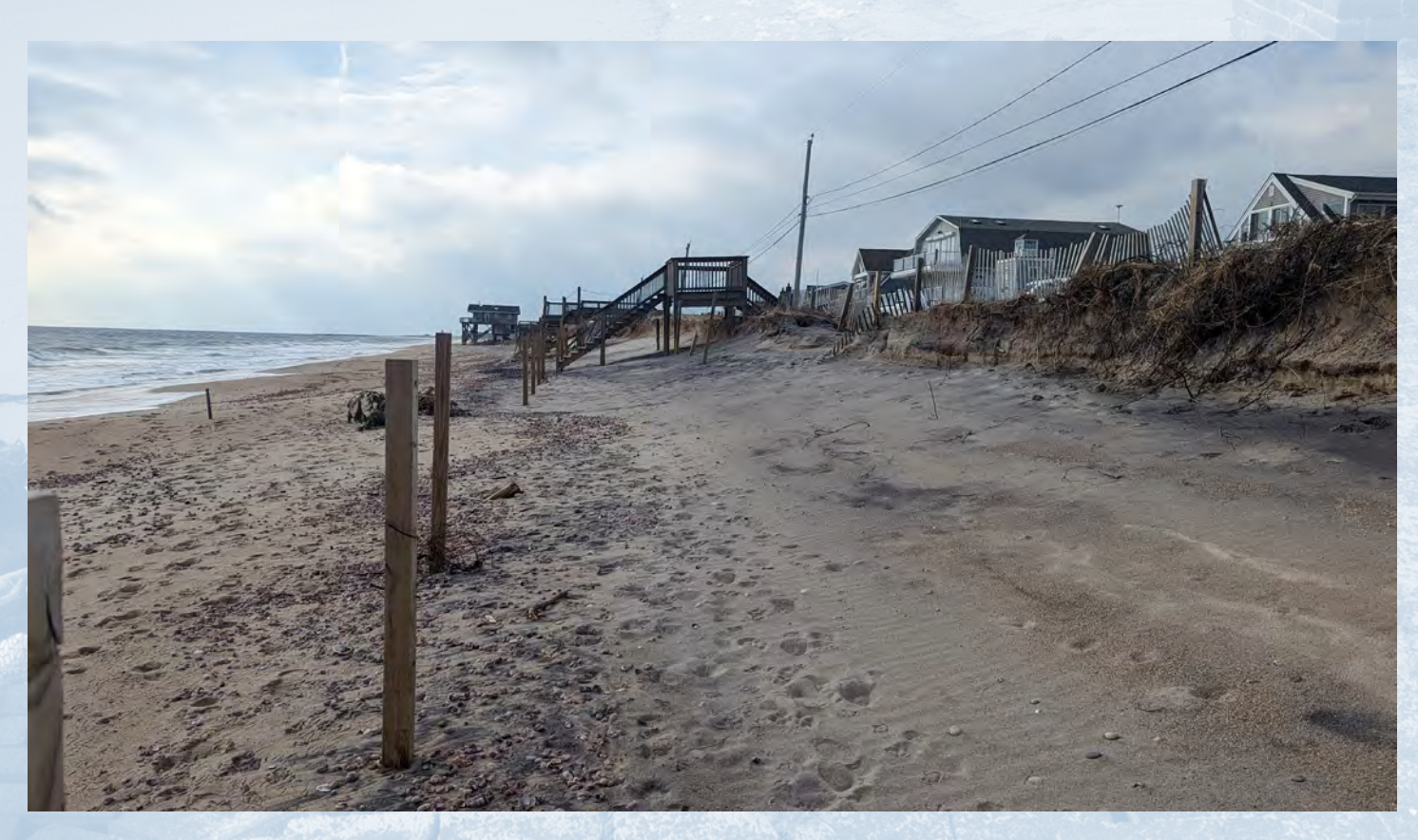
Charlestown Beach Road, South Kingstown