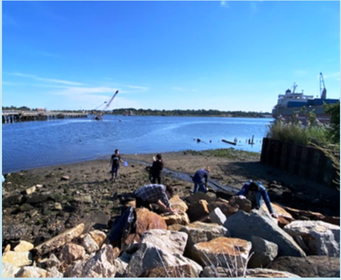
Volunteers clean up the CRMC's newly designated ROW at Public Street in Providence

CRMC, Save The Bay, and Clean Ocean Access had staff present at a number of CRMC rights-of-way, as well as other access points around the state. Staff from the CRMC and Rhode Island Sea Grant led the cleanup at the recently-designated Wilson Park CRMC ROW in North Kingstown, and CRMC and Save The Bay staff were also at Public Street CRMC ROW in Providence. Save The Bay spearheaded a cleanup at Atlantic Beach in Westerly, Passeonkquis Cove in Warwick, and the Mount Hope boat ramp in Bristol.