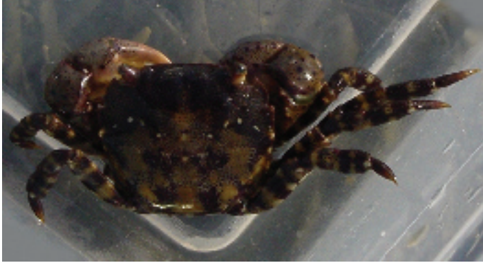
Salem Sound Coastwatch