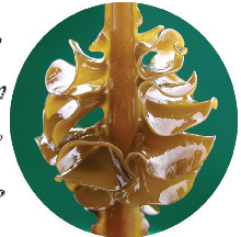
Illustration: © Rob Gough, DFBW