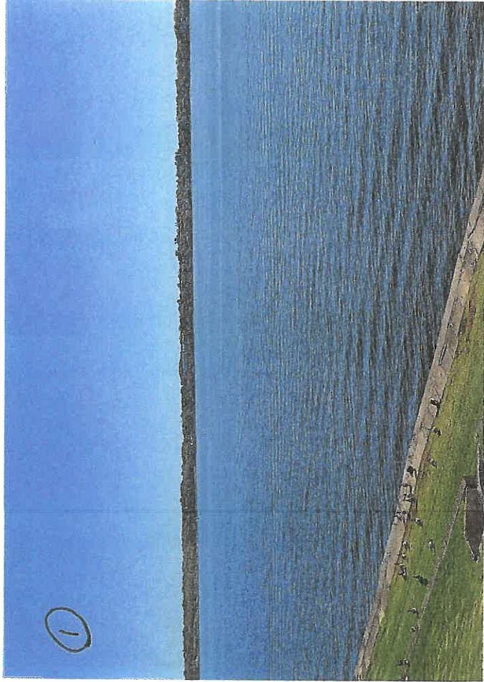
Looking west - north west