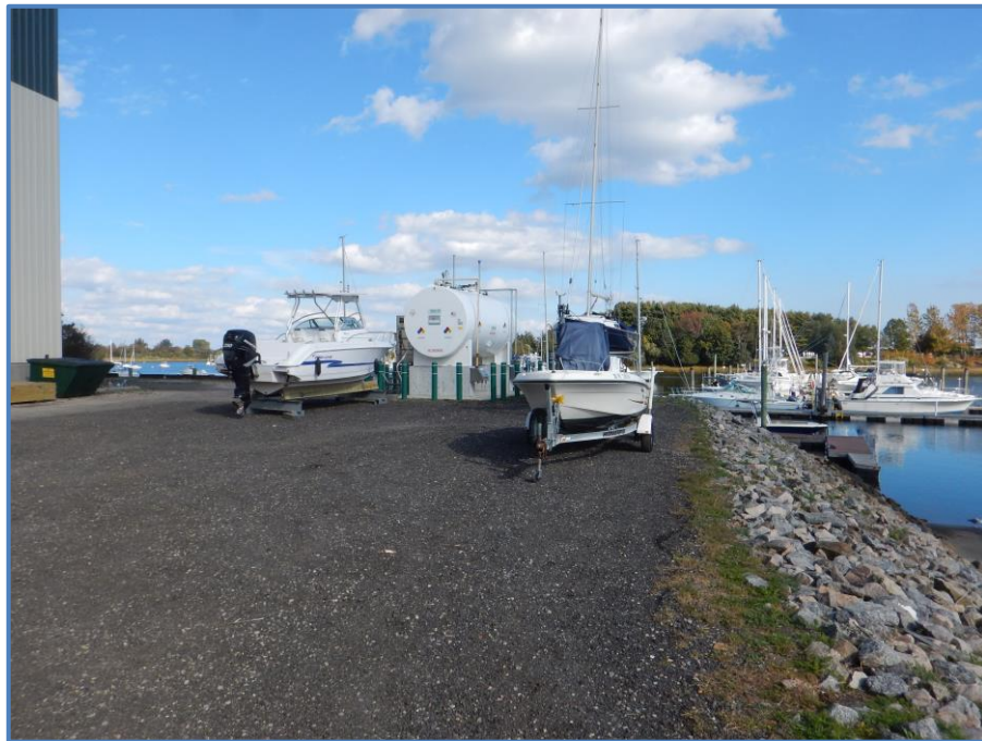
Photograph 6: Upland area behind the proposed Boat Well location