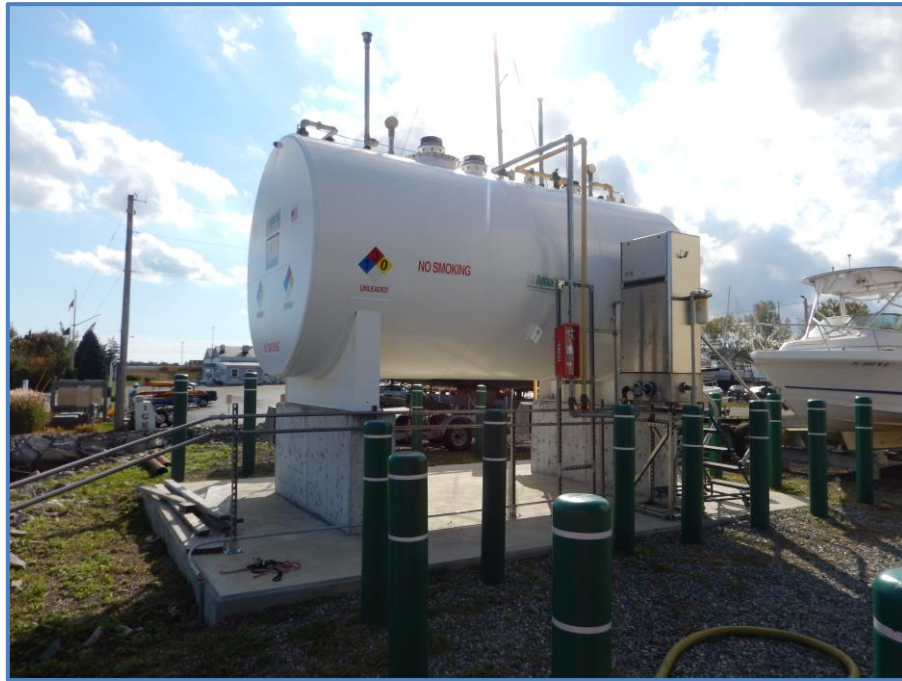
Photograph 7: Existing fuel tank and pad to be relocated