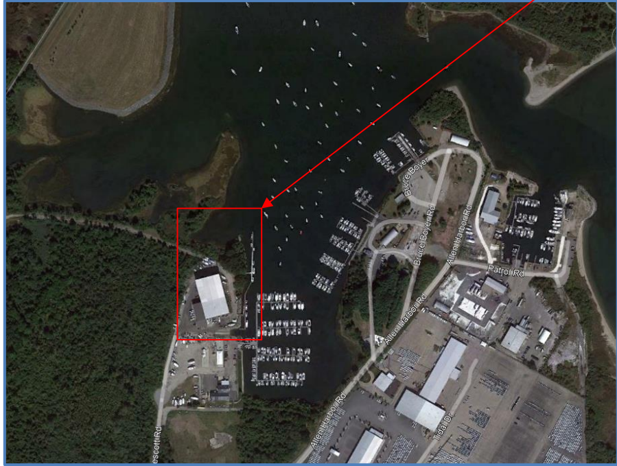
Photograph 1 – Aerial image of the site