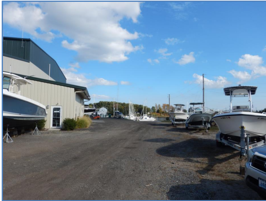
Photograph 11: Upland area near entrance to marina