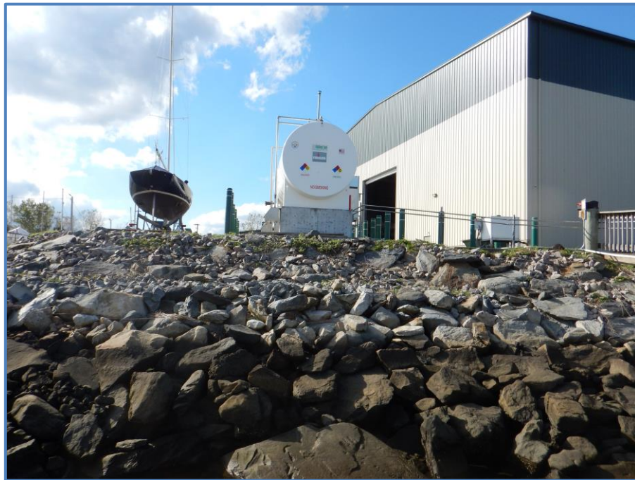
Photograph 4: Area in front of proposed Boat Well location