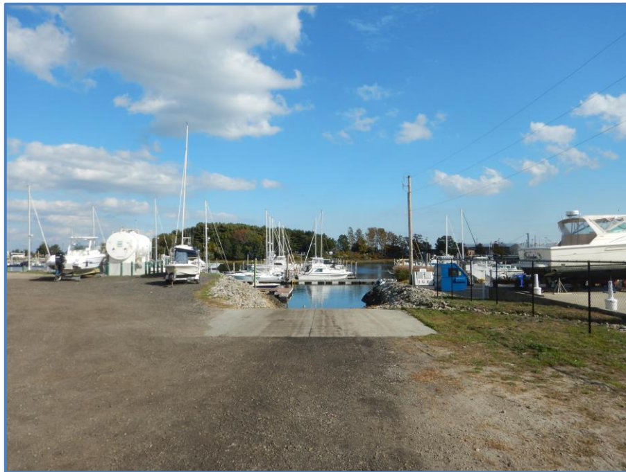
Photograph 8: Existing boat ramp adjacent to proposed Boat Well location