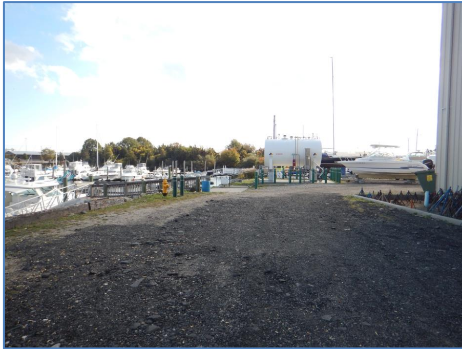
Photograph 5: Upland area adjacent to proposed Boat Well location