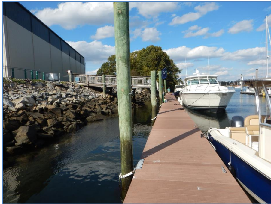
Photograph 10: Pier and docks near proposed location