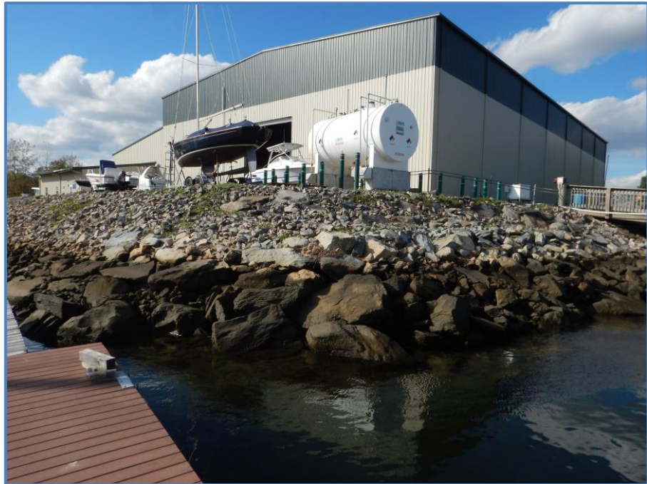
Photograph 2: Proposed Location for Boat Well