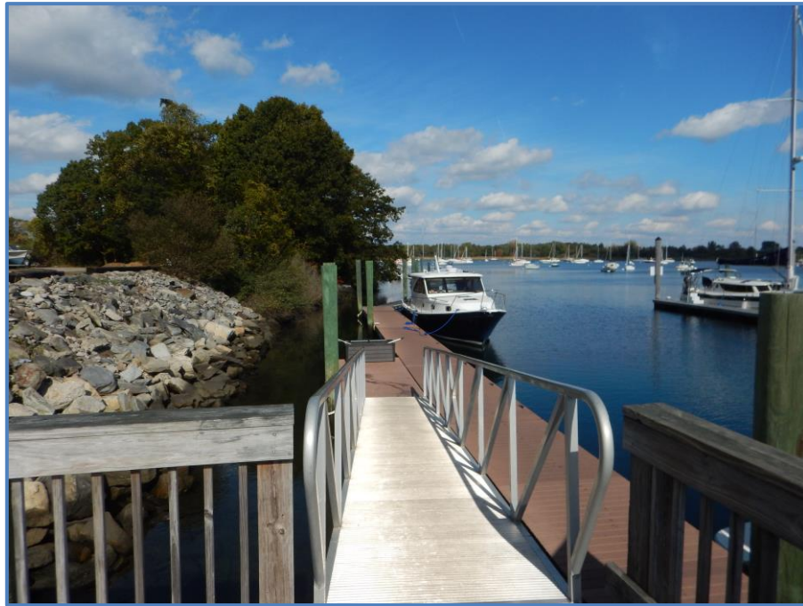
Photograph 9: Docks and Gangway near proposed location