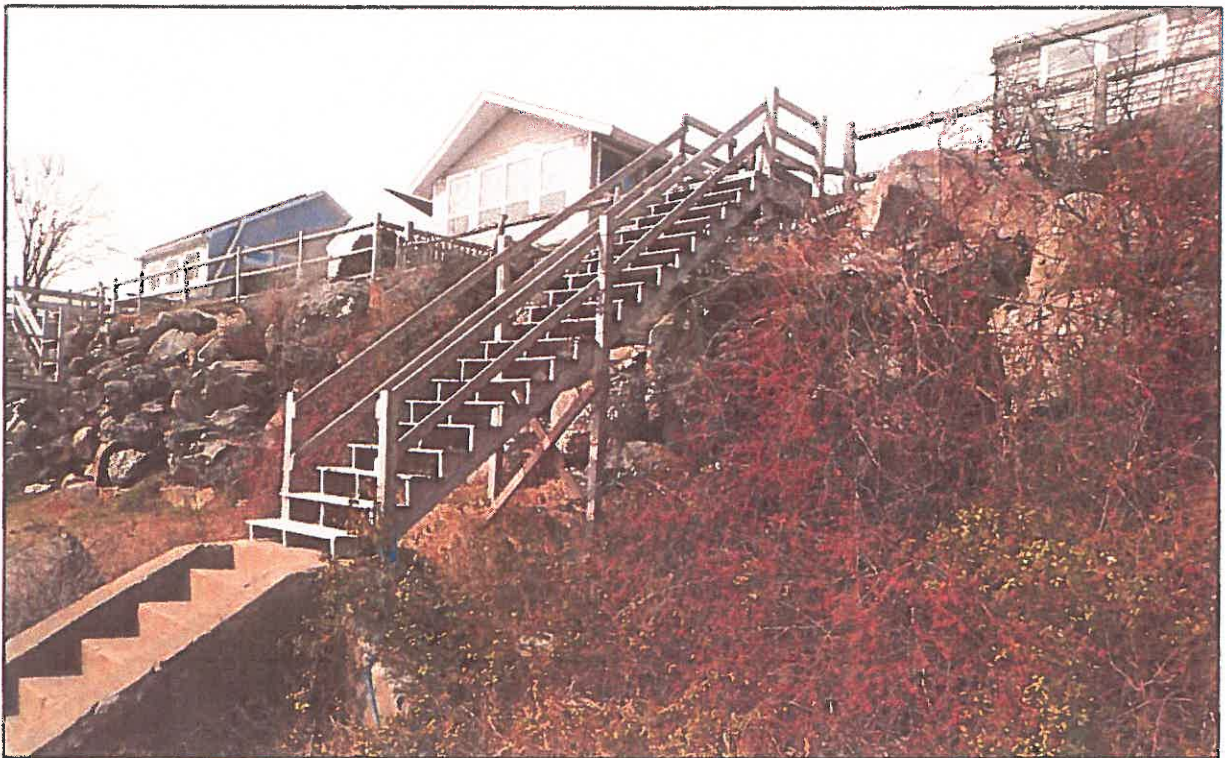
Photo 5: The lower terrace and stone gravity retaining wall associated with 4 Shell Road looking west.