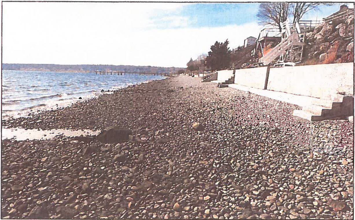
Photo 3: Cobble beach associated with 2 Shell Road looking southwest.