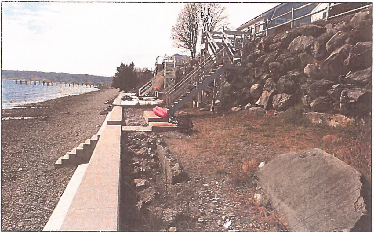
Photo 2: The lower terrace associated with 2 Shell Road looking southwest. Structures include a concrete seawall (left) and stone gravity retaining wall (right).