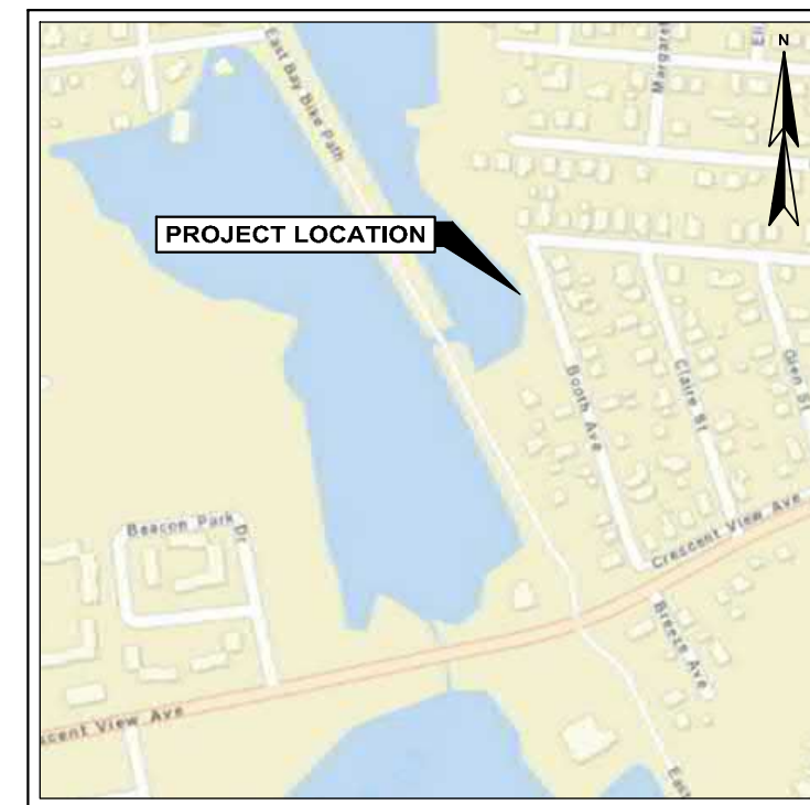
LOCATION PLAN SCALE: NTS