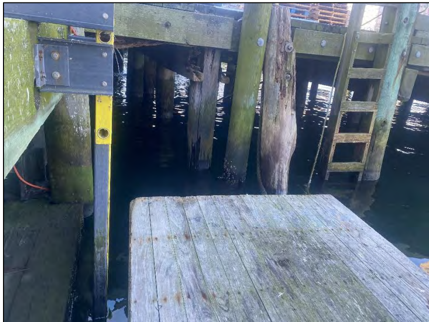
Photo 2: Support piles splintering and/or necking exhibiting signs that the piles are beyond the serviceable life in the current condition