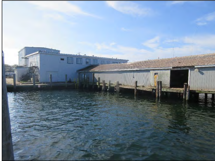
Photo 1: Pier F with missing and/or dislodged exterior chocks. Fenders along the building observed to be damaged and/or missing.