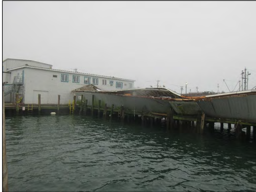
Photo 3: Prior to construction the building collapsed due to a snowstorm in March of 2023. The pier at this time is not in operation.