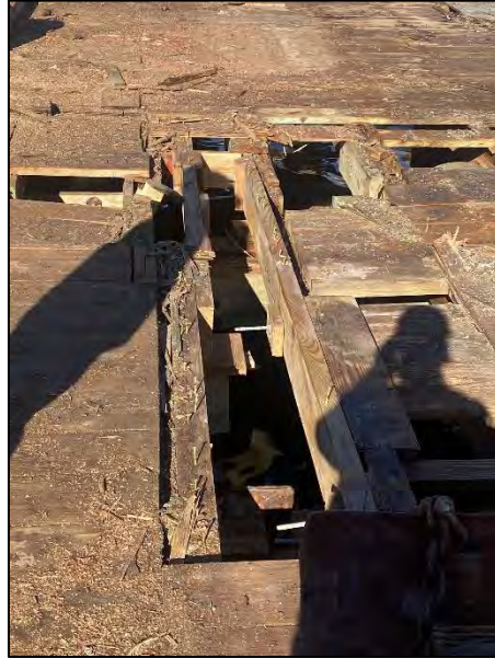
Photo 5: Gaps in decking board resulting from the removal of the previously collapsed building building.