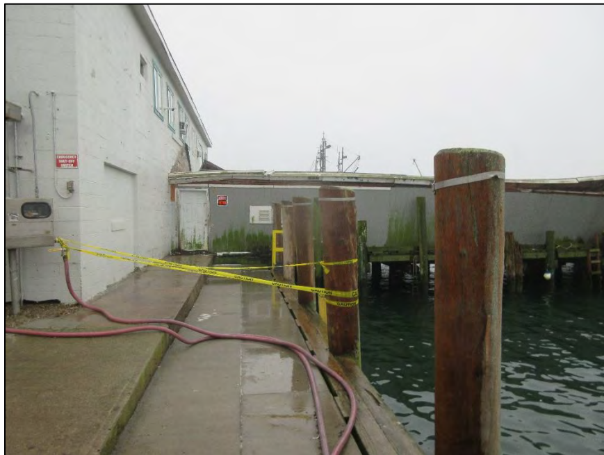
Photo 4: Original pier elevation continuing at an elevation higher than the existing bulkhead to connect to the landside buildings FFE.