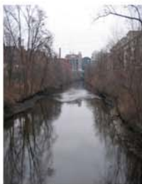
View Toward Mall