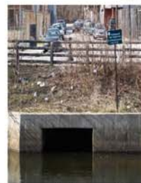
Pleasant Valley Stream