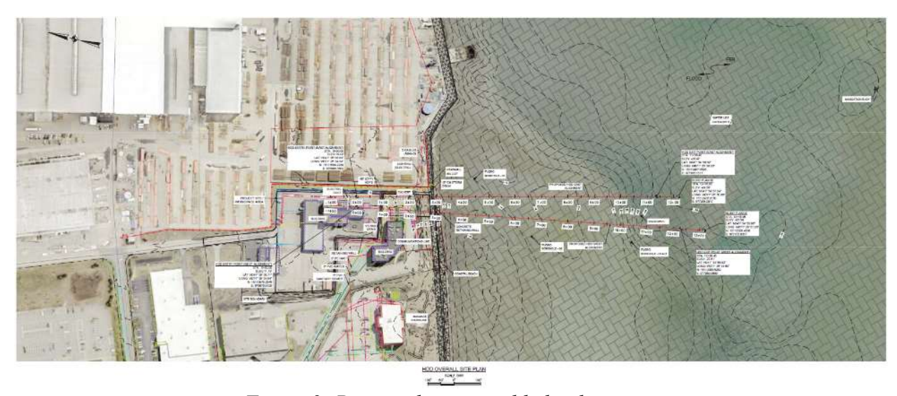
Figure 2: Proposed export cable landing area

volume to be excavated for the proposed offshore exit pits is approximately 4,352 cubic yards, and all excavated material will be loaded onto a support barge for reuse in filling the exit pits and no side casting of excavated material will occur. These activities will require both a State Water Quality Certification and Dredging Permit from the RI Department of Environmental Management. The RIDEM Water Quality Certification file is WQC 21-135 and the RIDEM Dredge Permit file is DP 21-187.