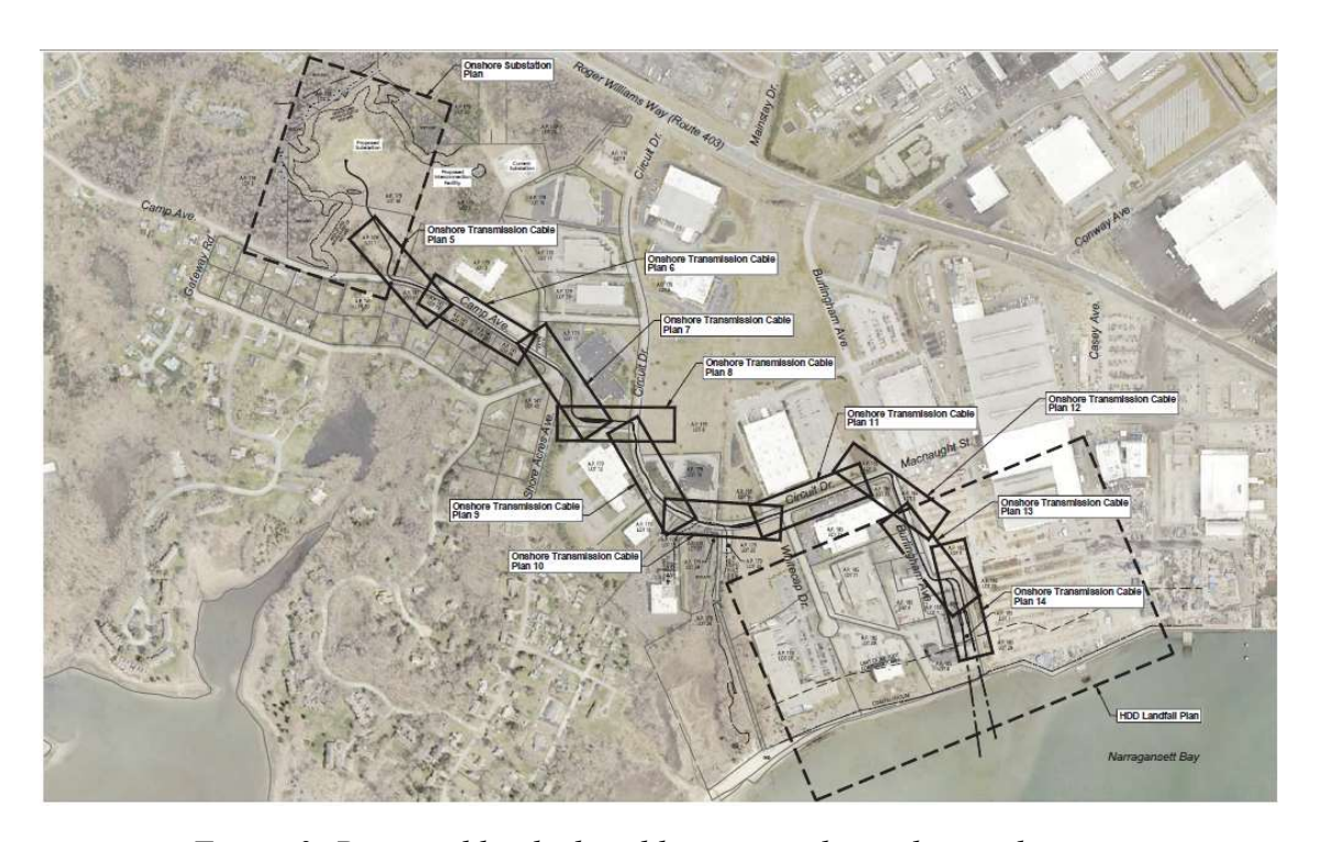
Figure 3: Proposed landside cable route to the onshore substation