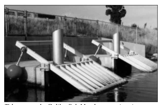
Tidegates at the Galilee Salt Marsh restoration site open to flood a restored salt marsh that had been destroyed after a road was built and blocked the twice-daily tidewaters from reaching the marsh.

the information, maps, and resources available from the Rhode Island Habitat Restoration Portal Web site. The interactive features of the Web site were not reproducible on the CD-ROM. These include the Project Inventory searchable database, the searchable Restoration Bibliography, and the Restoration Atlas interactive mapping application. Static versions of these features are included on this CD-ROM for viewing only. Additionally, the CD-ROM provides only a subset of the maps and species information available on the Web site.