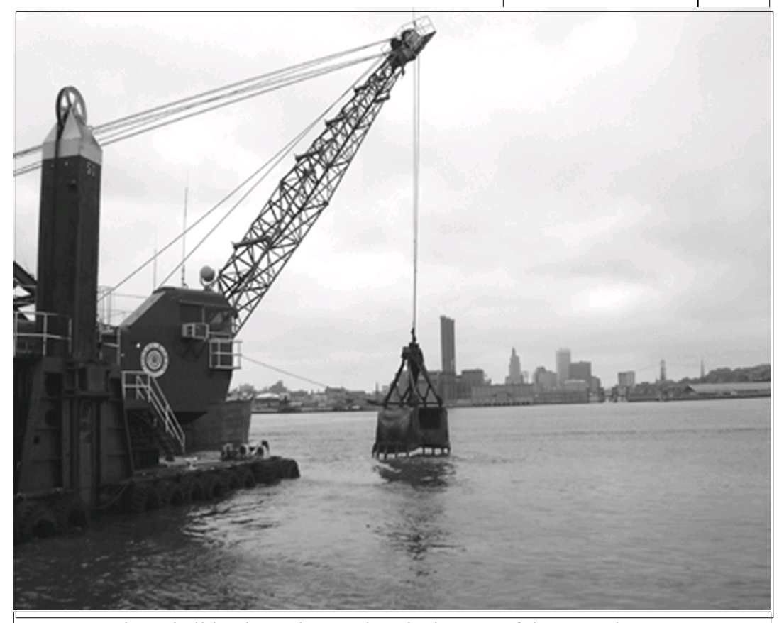
A gaping clam shell bucket is lowered to the bottom of the Providence River to scoop out a load of sediment as part of the Providence River and Harbor Dredging Project. The project will restore the seven-mile long Providence River Shipping Channel to its federally mandated 40 foot depth and 600 foot width.