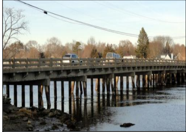
Central Bridge 182 in Barrington will be rebuilt with features to increase its resilience to sea level rise.

New initiatives are beginning to invest in climate change assessment and adaptation, including: revision of infrastructure design and construction standards; interagency and inter-government planning and coordination; public education and outreach; and research and monitoring. A goal of the Commission is to foster these activities and identify additional collaboration opportunities essential for climate change adaptation and resilience in Rhode Island.