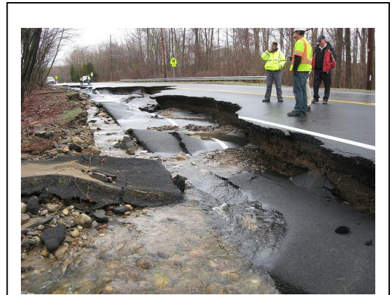
Road damage in Hopkinton from the 2010 floods.

Stronger, more frequent storms may damage and destroy transportation infrastructure by erosion, precipitation that overwhelms stormwater infrastructure, storm surges, wave activity, and heavy snow accumulation. Shoreline erosion may also present major threats to public safety. Matunuck Beach Road in South Kingstown, which provides the sole access and emergency evacuation routes for 240 residences, could be severed due to a combination of long-term erosion of the beach and the coastal bluff that fronts the roadway because of storms and sea level rise, and the sudden substantial erosion losses caused by storms.