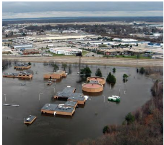
Flooding in 2010 closed the Warwick Sewer Authority treatment facility and discharged large volumes of untreated sewage into the Pawtuxet River.

Sea level rise, warming air and water and increased storminess have distinct and multiple consequences depending upon which facet of society, environment, and economy one looks at. The Commission has identified four major risk categories as top concerns for Rhode Island: 1) wastewater infrastructure vulnerability due to projected sea-level rise, increased severity of storm events, and increased precipitation and flooding; 2) impacts upon our drinking water supplies due to seal-level rise, storm surges and increased inland flooding; 3) energy infrastructure vulnerability resulting in prolonged loss of power and hazards resulting from downed lines; 4) public health and safety risks to coastal populations due to flooding and storm surges, and public health and safety risks to urban populations due to heat waves and flooding.