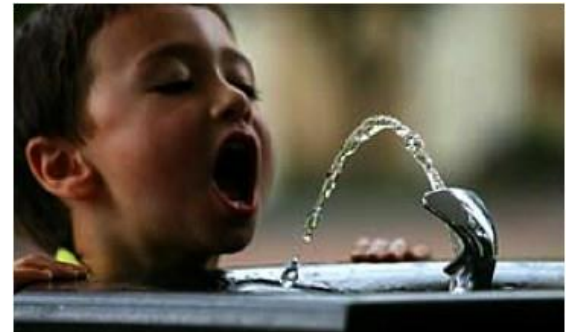
Coalition for Water Security

Drought will impact surface water and groundwater quality. The degree of this effect will be a function of many factors, drought severity being one. When surface water reservoirs are depleted, one may expect increasing water temperatures, changing water chemistry, a re-suspension of dissolved solids (turbidity) and increased opportunities for bacteria and algae growth that will require additional treatment. For groundwater systems, the wells are at a fixed elevation. During drought (or short-term dry spells), these systems are subject to drawing down on a water column that is closer to their intake screens, increasing the susceptibility of these