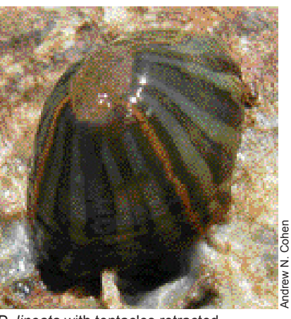
D. lineata with tentacles retracted