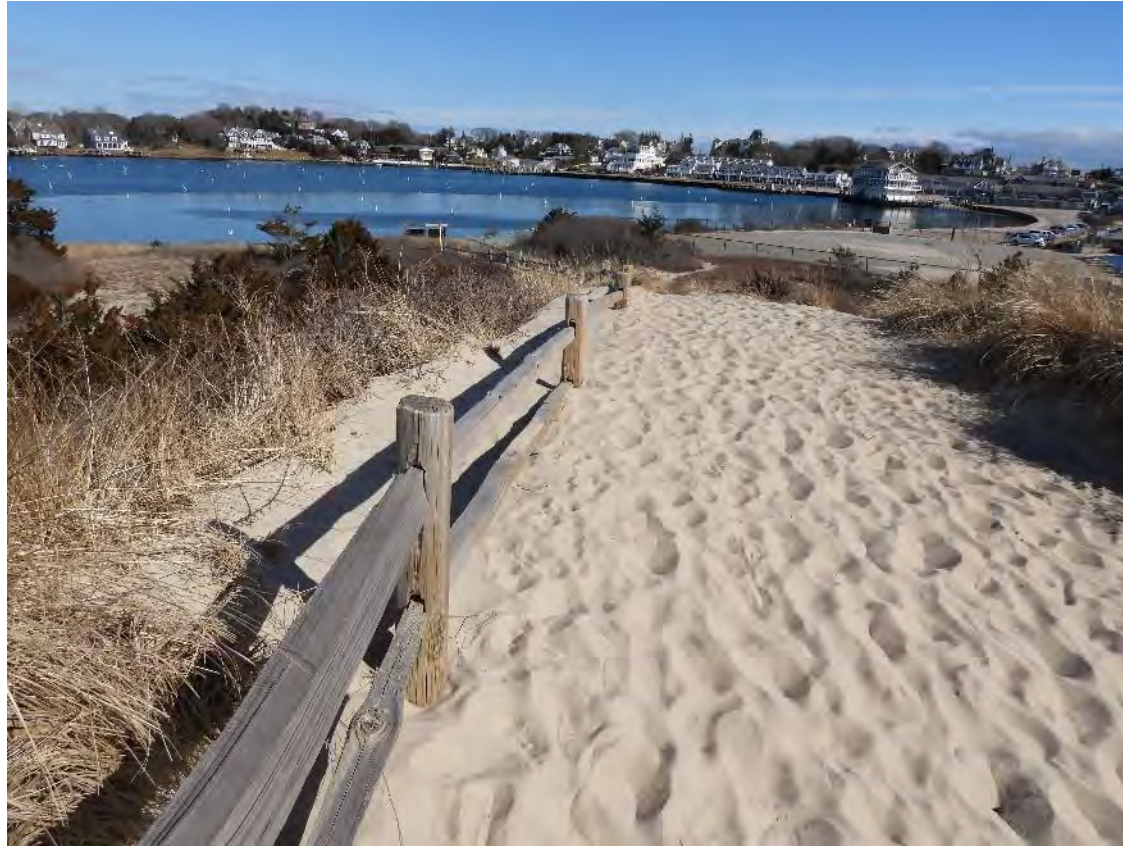
Section of the fences to be leveled due to sand buildup from storms.