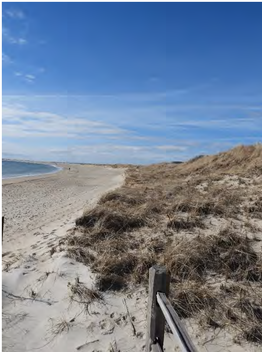
Maritime Herbaceous Dune habitat around the section of the fence to be reinstalled and leveled.