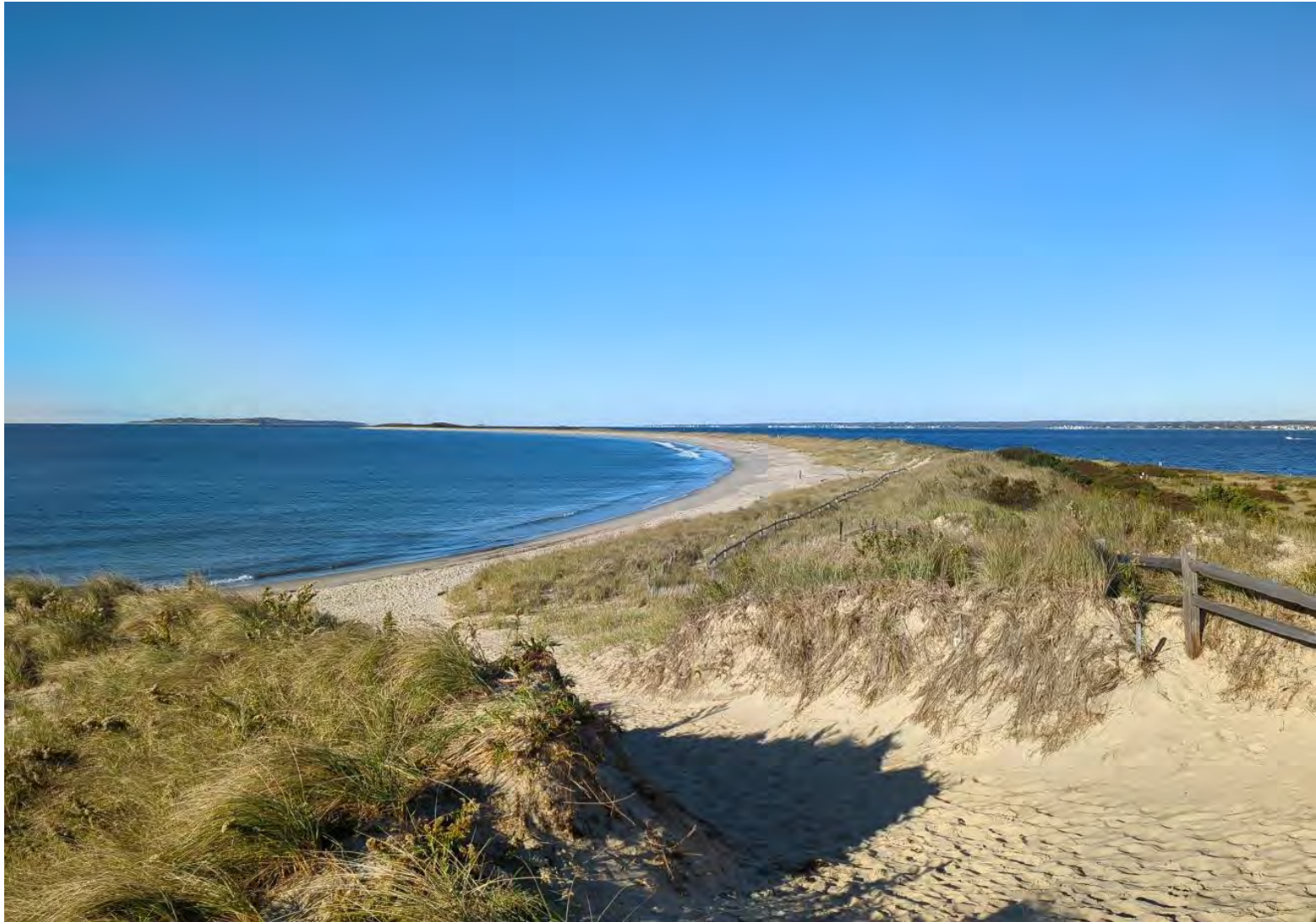
Napatree Point Conservation Area – Coastal Barrier Spit