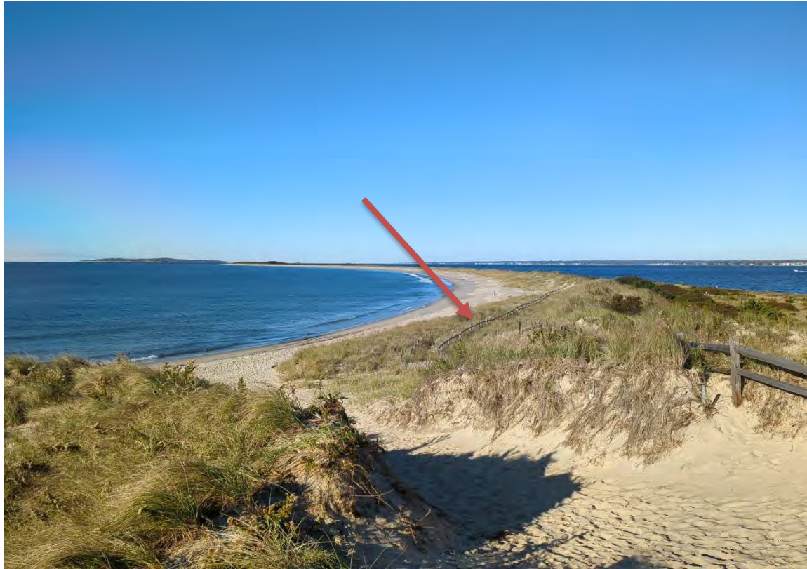
Location of fence reinstatement area