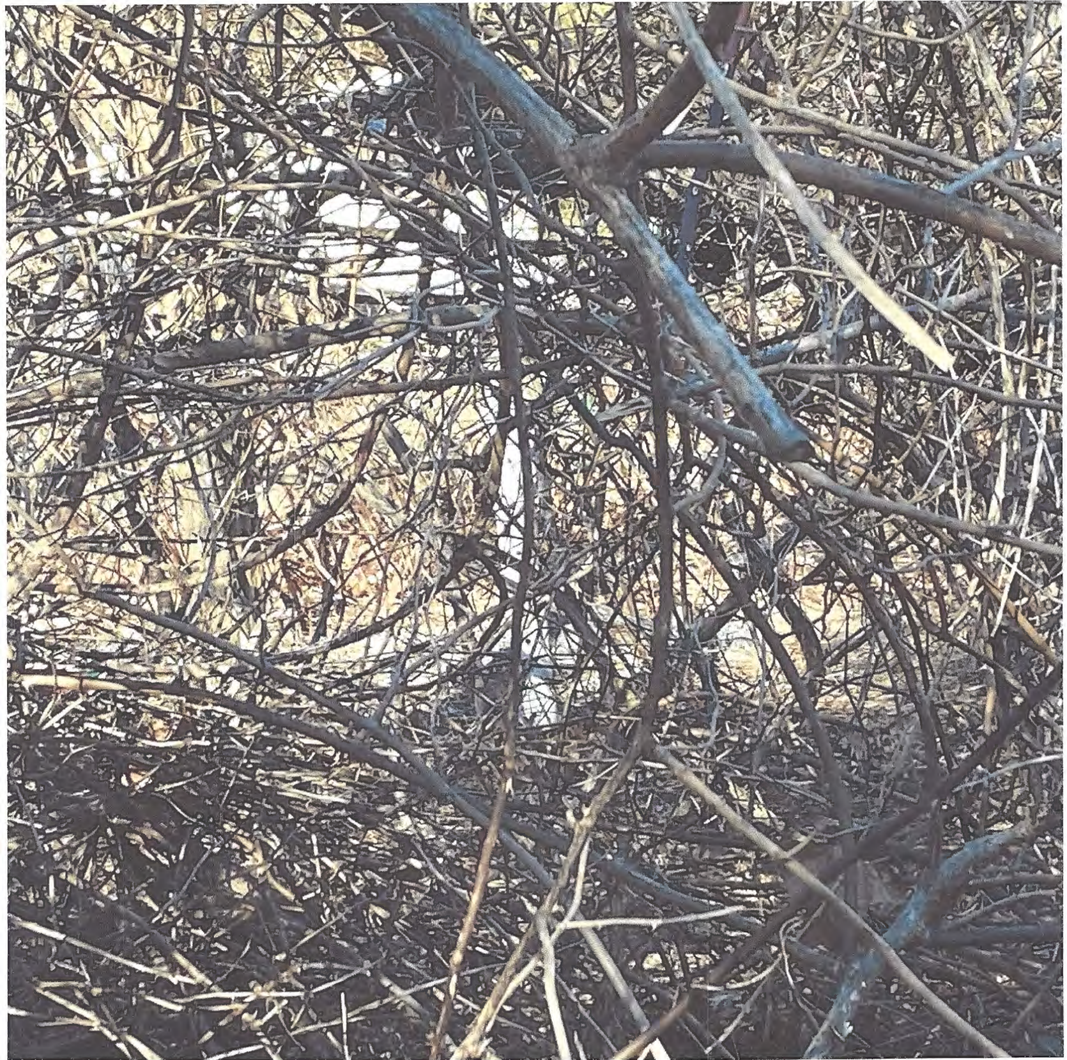
Proposed Dwelling Site Looking Forward toward Proposed Driveway Street