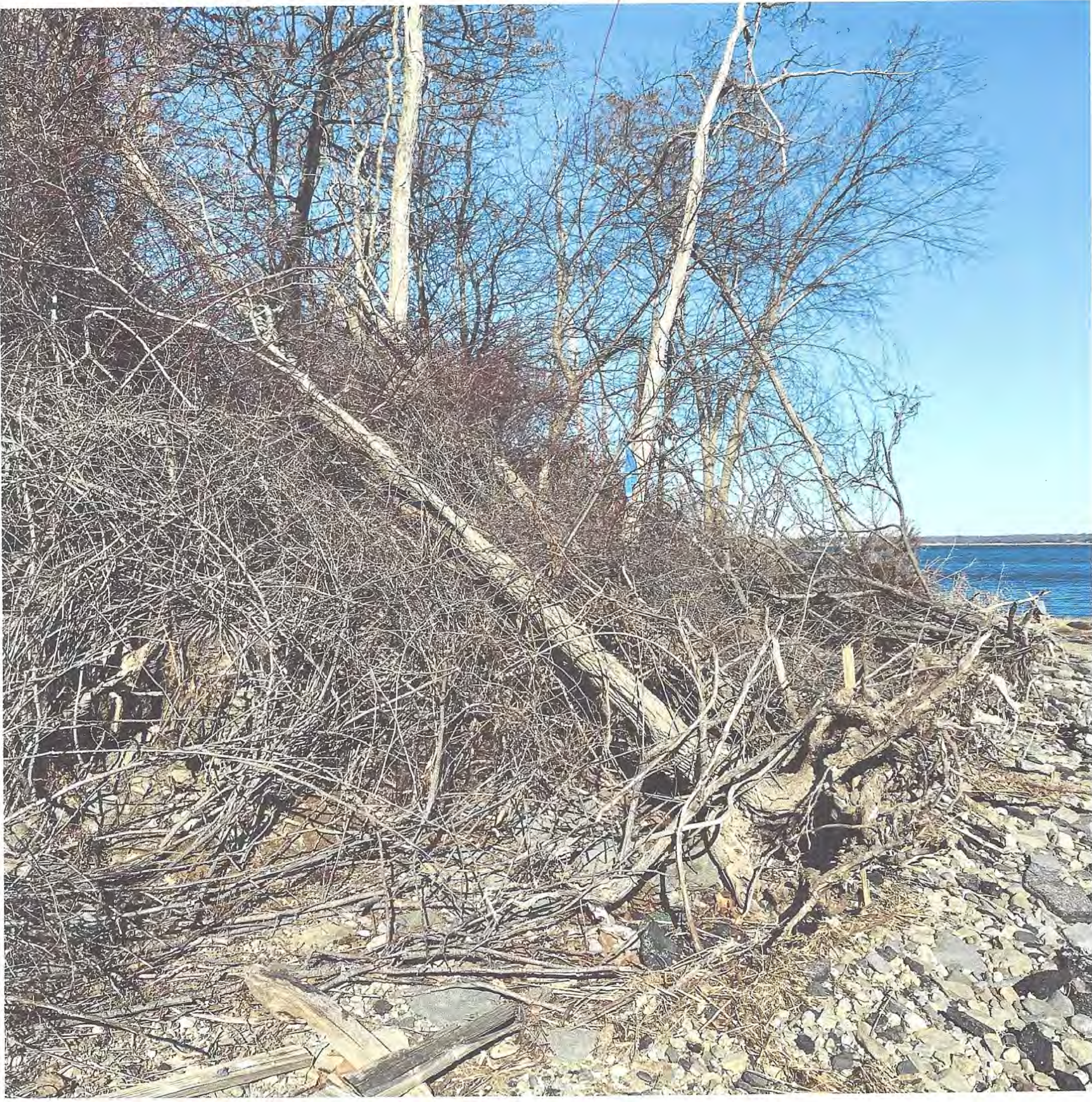
Bryside Coastal Feature Photo

RECEIVED 3/12/2025 COASTAL RESOURCES MANAGEMENT COUNCIL