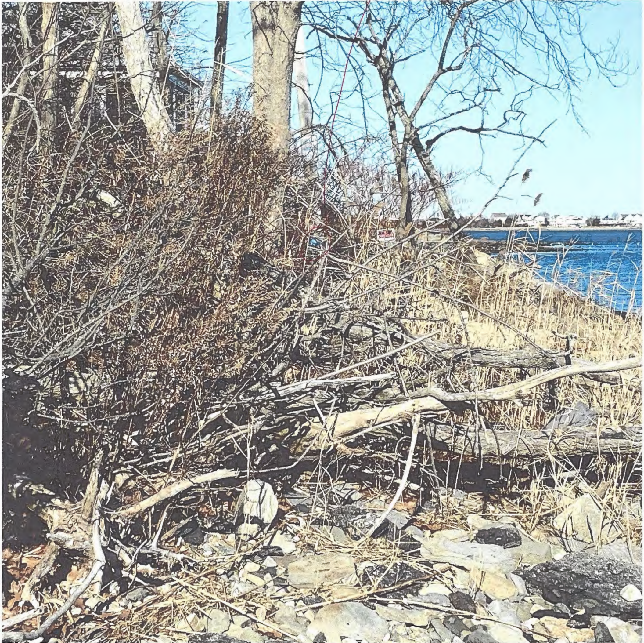
Bayside Coastal Feature Photo

RECEIVED 3/12/2025 COASTAL RESOURCES MANAGEMENT COUNCIL