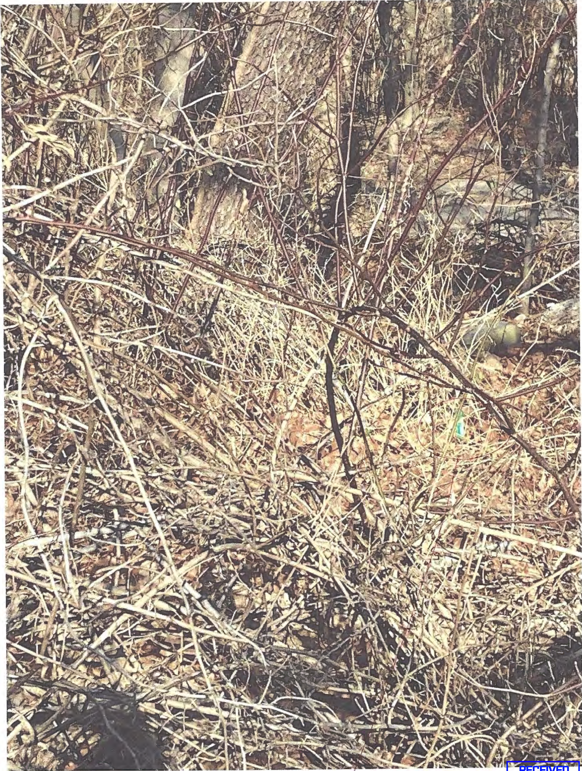
Proposed Left Front PAGE 040 Corner of Dwelling Site (Back Side Access)

RECEIVED 3/12/2025 COASTAL RESOURCES MANAGEMENT COUNCIL