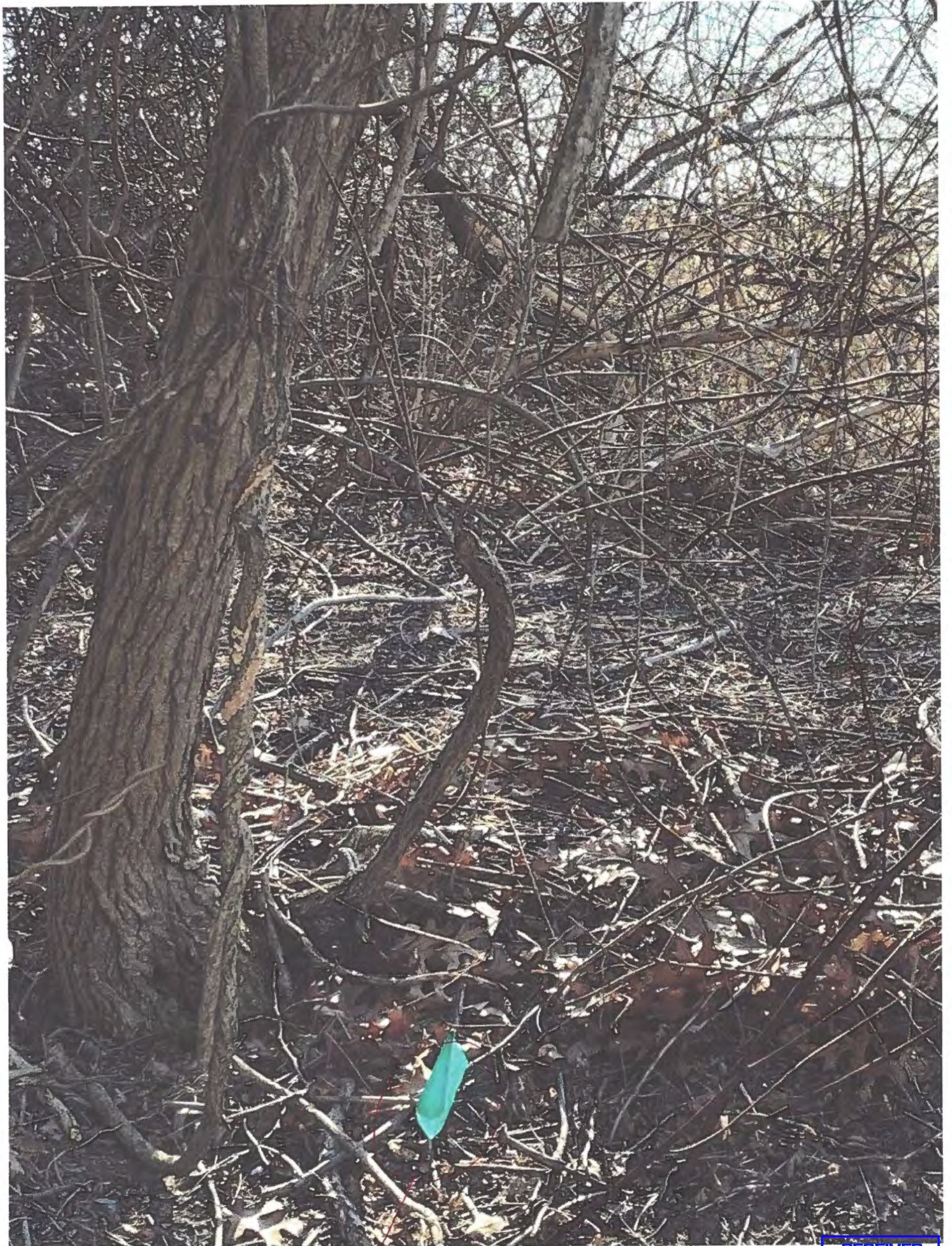
Proposed front right corner of Dwelling site (Bank 1)