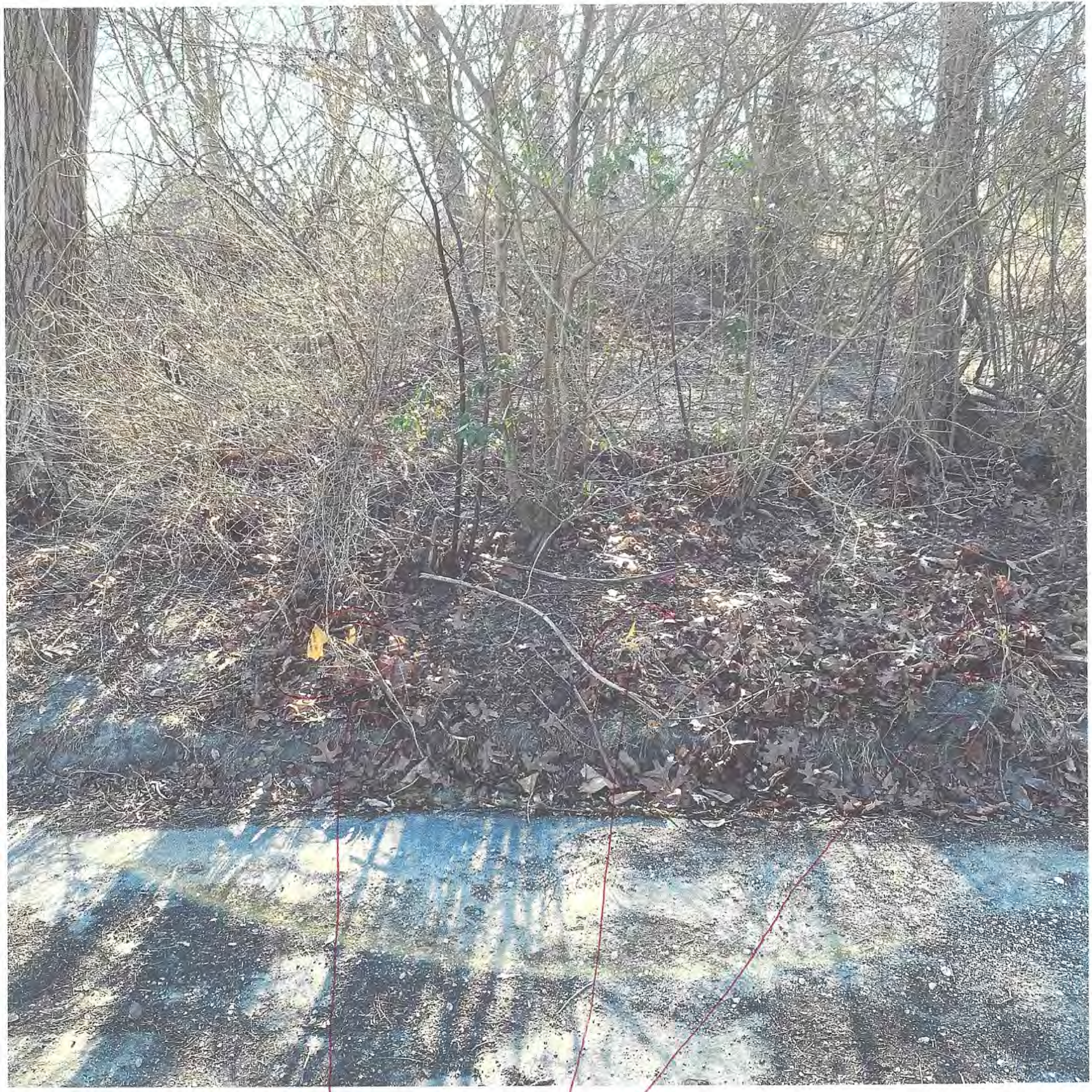
GAS & Water Connection in Street in Front of Yellow Flags