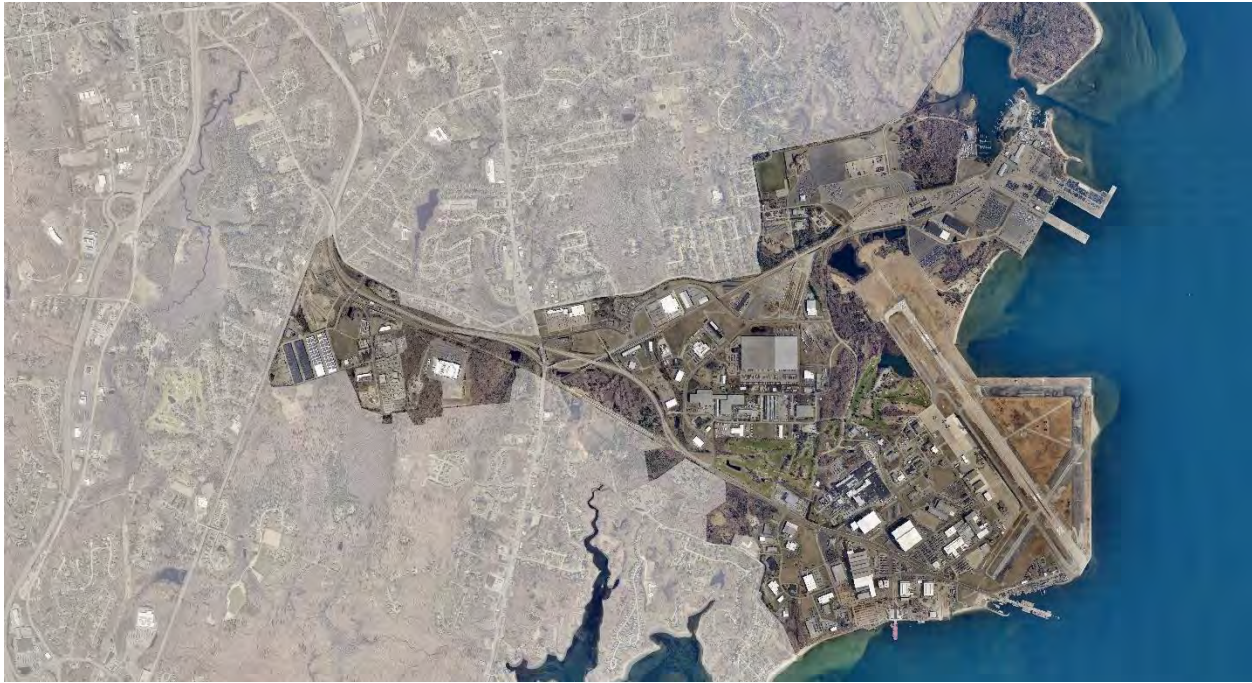
Photo 3: Aerial Photo of Quonset Business Park and Port of Davisville highlighted.