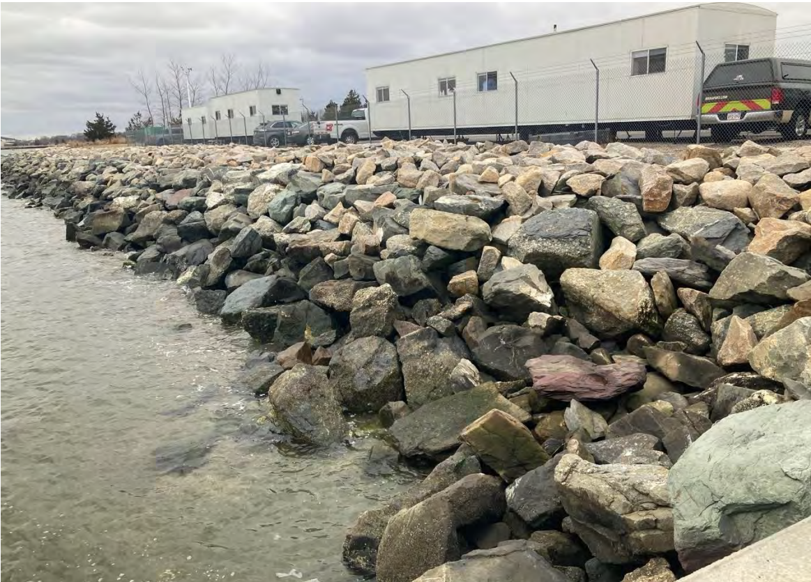
Photo 4: Existing Riprap Shoreline on QDC Property where Blue Economy Support Docks & Vessel Launch Ramp are Proposed.