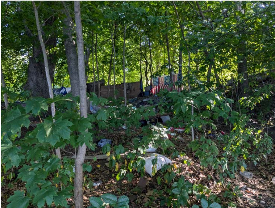
View of vegetation in the location of the proposed South Stormwater Basin—facing north.

PHOTOGRAPHIC DOCUMENTATION Tidewater Landing Phase 1B—Assent Application Pawtucket, Rhode Island Photographs Documented September 5, 2024