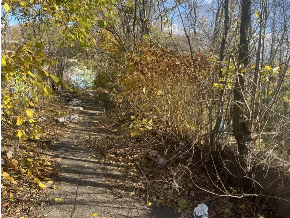
View of the location of the proposed Tidewater East Plaza —facing east