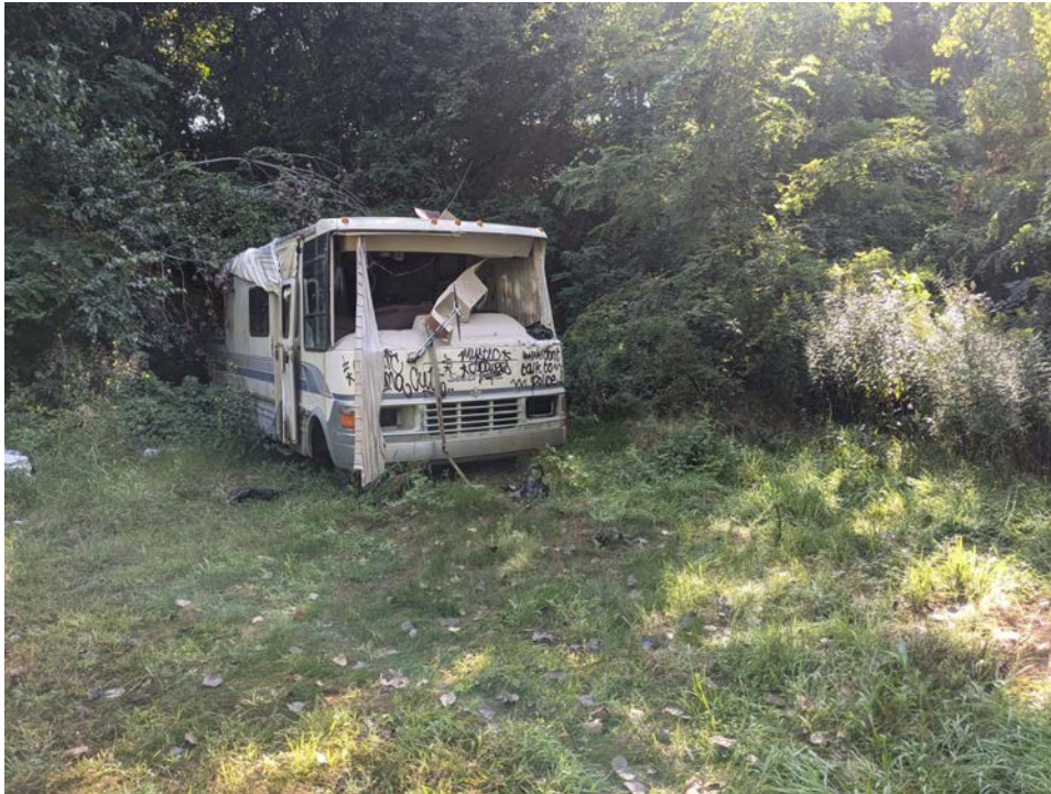
View of vegetation and anthropogenic debris in the location of the proposed North Stormwater Basin —facing east.

PHOTOGRAPHIC DOCUMENTATION Tidewater Landing Phase 1B—Assent Application Pawtucket, Rhode Island Photographs Documented September 5, 2024