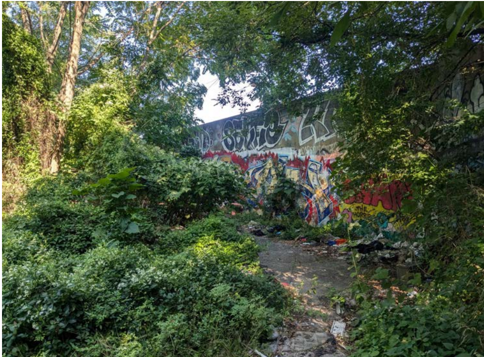
Another view of the location of the proposed Tidewater East Plaza—facing northeast.