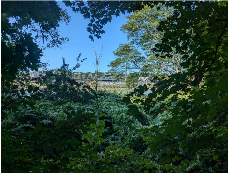
View of common reed ( Phragmites australis ) within the coastal wetland and Japanese knotweed ( Reynoutria japonica ) within the proposed Wetland Restoration Area—facing west.

PHOTOGRAPHIC DOCUMENTATION Tidewater Landing Phase 1B—Assent Application Pawtucket, Rhode Island Photographs Documented September 5, 2024