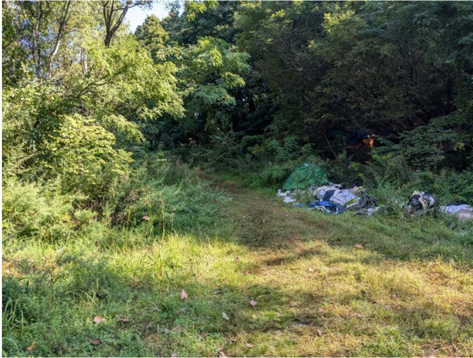
View of vegetation and footpath in the location of the proposed Upper Riverwalk —facing north.