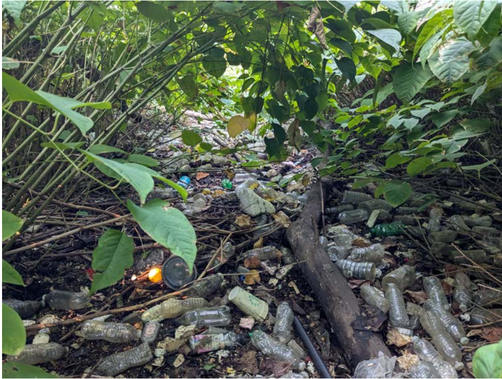
View of the conditions within the proposed Wetland Restoration Area—facing west.