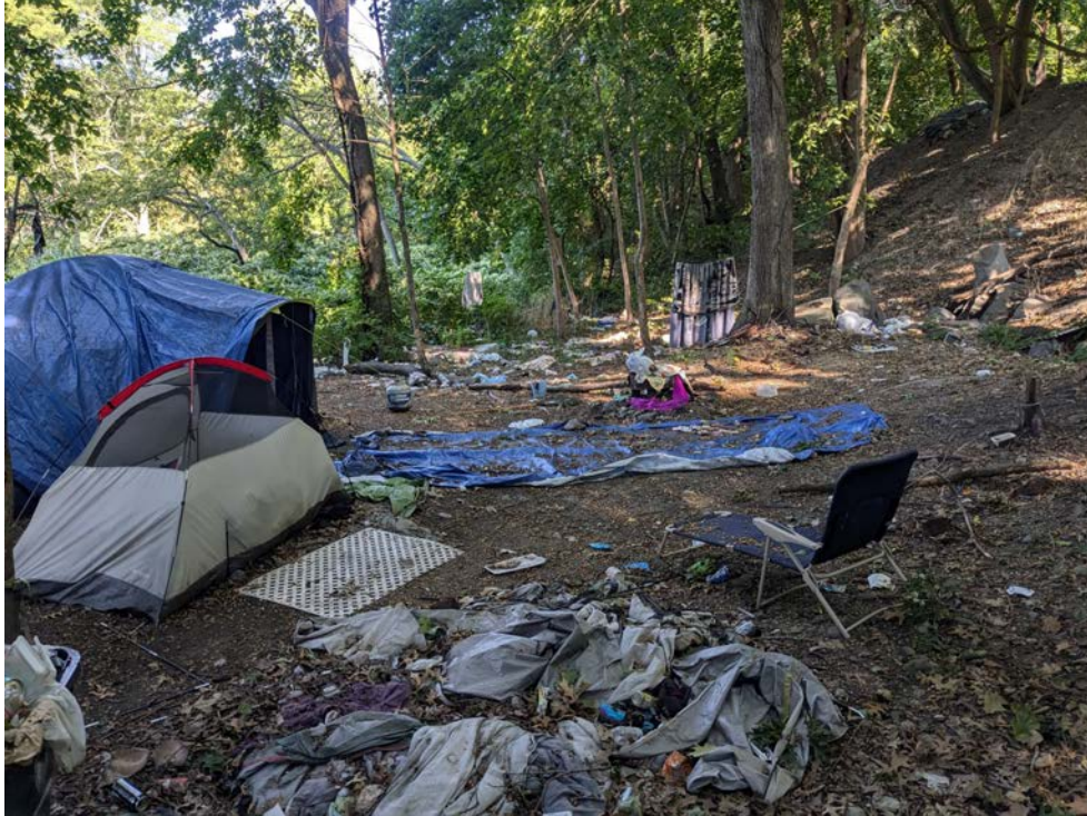
View of anthropogenic debris and vegetation in the location of the proposed Upper Riverwalk—facing northeast.