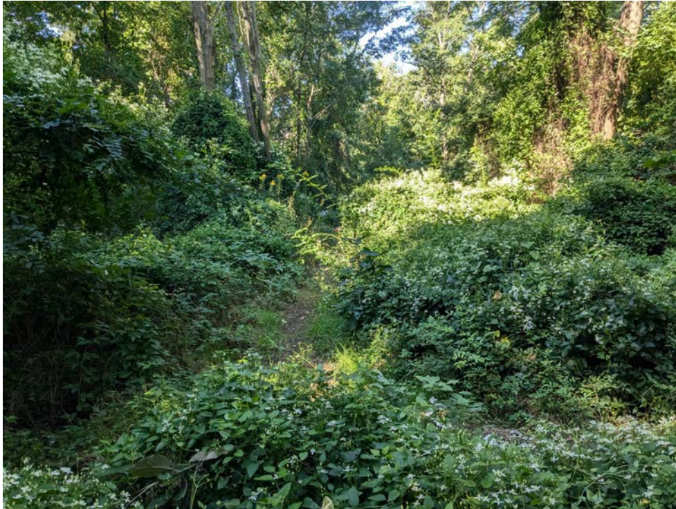
View of vegetation and footpaths in the location of the proposed Lower Riverwalk—facing southeast.