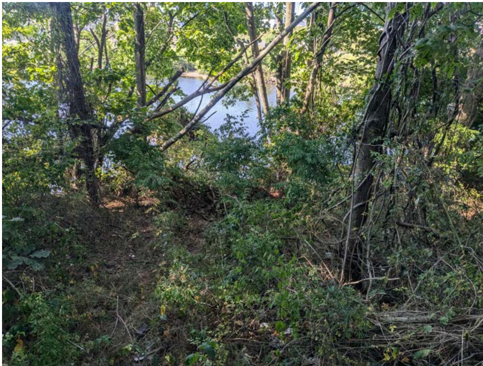
View of vegetation on the coastal bluff along the location of the proposed Lower Riverwalk —facing west.

PHOTOGRAPHIC DOCUMENTATION Tidewater Landing Phase 1B—Assent Application Pawtucket, Rhode Island Photographs Documented September 5, 2024