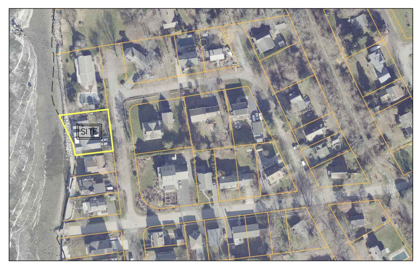
SITE LOCUS NOT TO SCALE

SURVEY NOTE: 1.) EXISTING CONDITIONS AND BATHYMETRY TAKEN FROM PRINCIPLE COMPANY - SURVEYING DIVISION (DATE: 03/31/2026) DOCK COVERAGE: PROPOSED FIXED DOCK: ±438 S.F. PROPOSED GANGWAY: ±60 S.F. PROPOSED FLOATING DOCK: ±150 S.F.